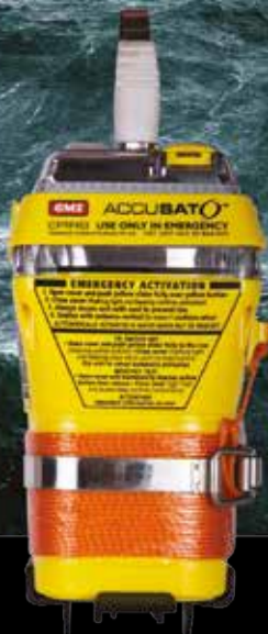
PART NO: MT603G