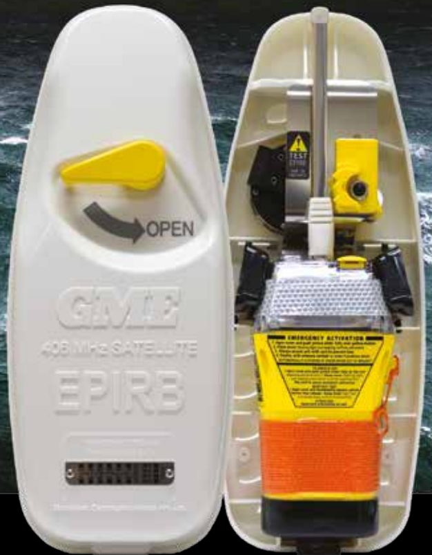
PART NO: MT603FG